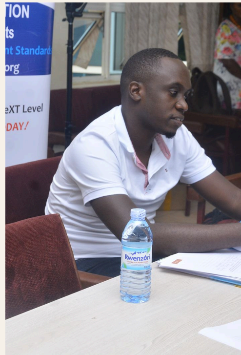
A training session in progress. Standards work is documentation, decisions and review, the daily habits of a well-run office.

You leave with the whole map and a clear sense of where you fit. From here the path is yours: the PECB Foundation, then Lead Implementer and Lead Auditor when you are ready to certify and audit for a living. As an ISO Ambassador, those next courses come at a 15% discount.